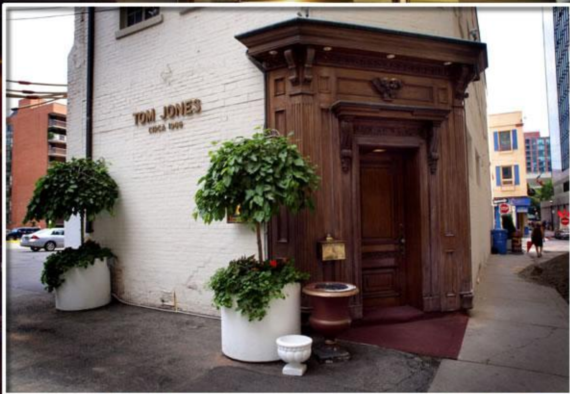
TOM JONES STEAK HOUSE